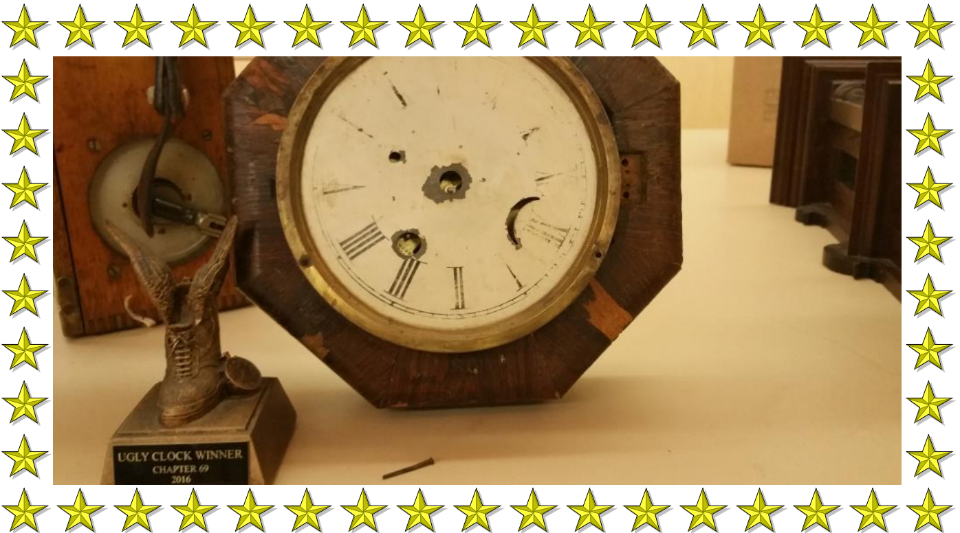
Chapter 69 - 2016 Ugly Clock Winner