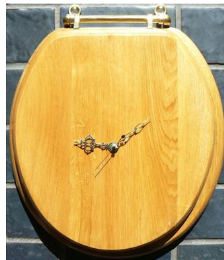
A toilet seat clock... really?

This September, bring in your strangest, ugliest, most bizarre clocks and watches to share.