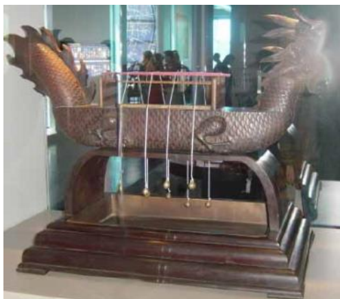
Chinese Incense Alarm Clock