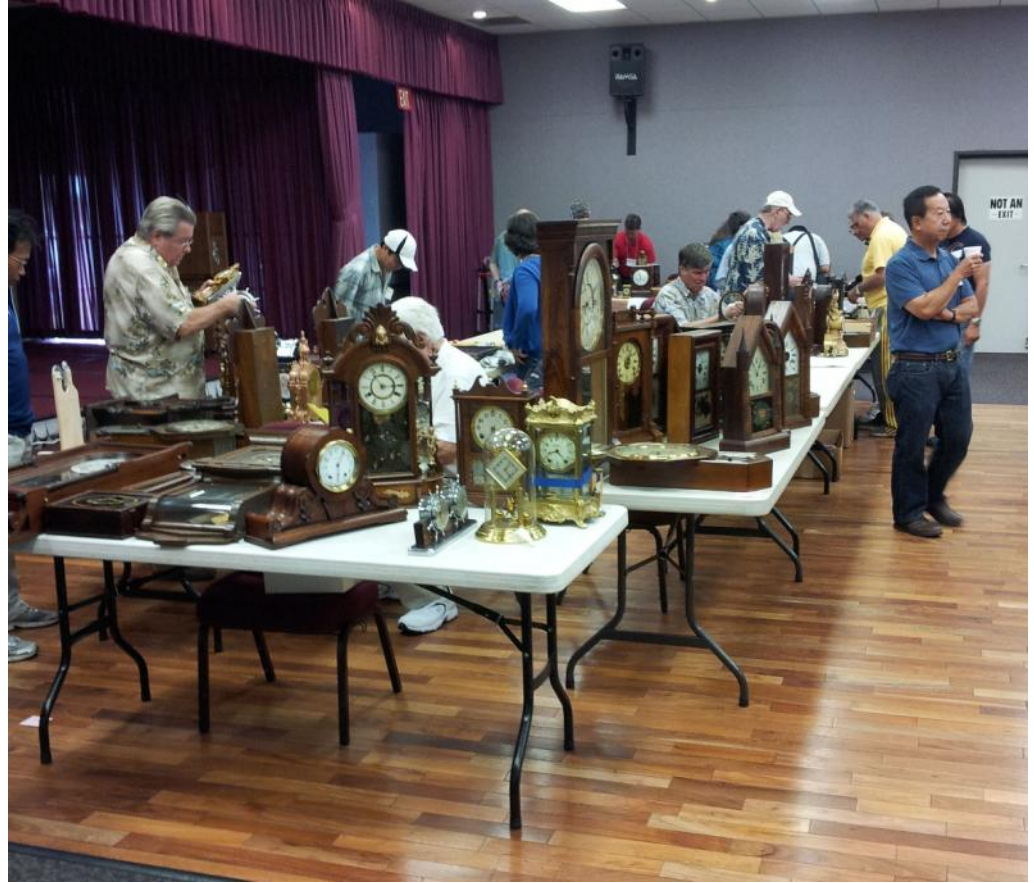
Nineteenth Annual Chapter 69 Goodyme Supermart Saturday, May 18, 2013