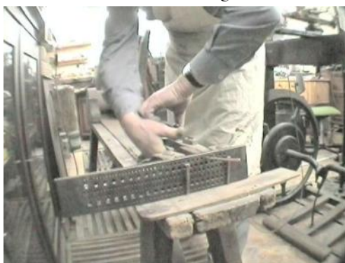
Tube making using Drawbench