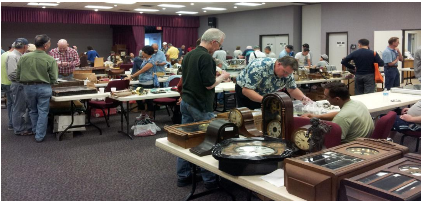
Nineteenth Annual Chapter 69 Goodyme Supermart Saturday, May 18, 2013