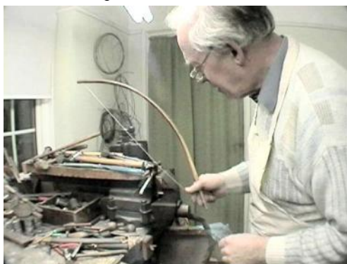
Using the Bow Lathe