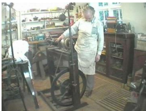
Holtzapffel Treadle Lathe