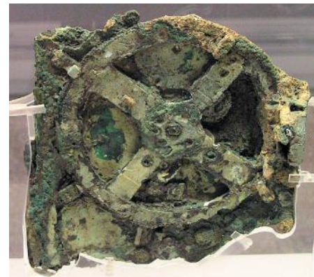
The Antikythera Mechanism (Fragment A—front)

This month we will see a recent Nova show on the Antikythera Mechanism, described as the earliest computer. This device is believed to have been made in the 1st century B.C. It was used to predict the position of the moon as well as eclipses of both the