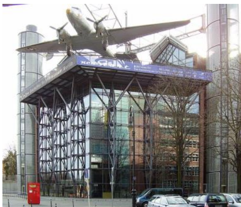
Museum of Technology in Berlin