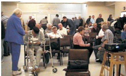
A busy, busy mart at the last meeting!