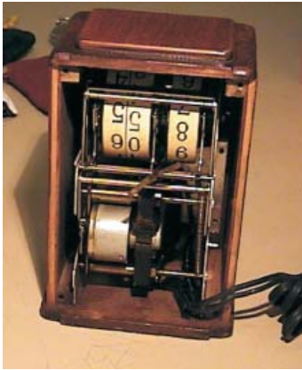
A Digital AC Clock from Show & Tell

Our main program consisted of two videos on the Antikythera Mechanism, which was found in the Mediterranean 1900 and was very unusual because it had gears. It was studied by Derick Desola Price in 1951 and was found to be similar to "A calendar computer" made by Archimedes. This was also similar to Babbage's mechanism. This mechanism has a metonic cycle, eclipse cycle and a 4 years Olympic games cycle. A model of it was shown in the second video.