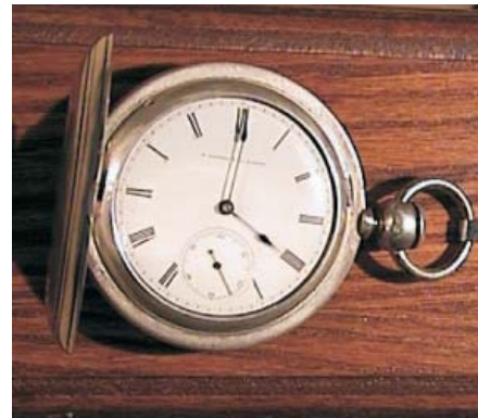
Howard Series 3 from Doug's collection.