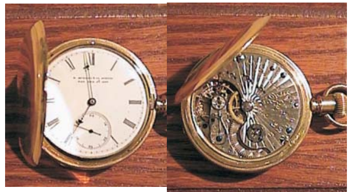
Howard Series 8, front & back from Show & Tell.