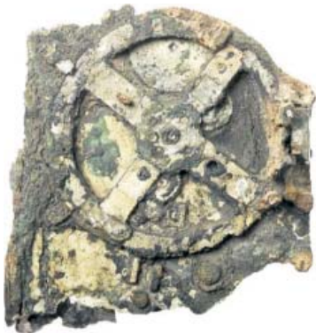
Antikythera Mechanism from our March Video Presentation