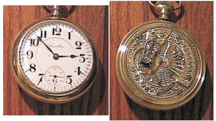
Hamilton Montgomery with highly decorated movement from Show & Tell