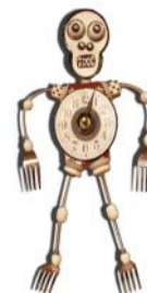
No, no, no!

He will also bring an English fusee movement from a dial clock and discuss how it could be converted to a skeleton clock.