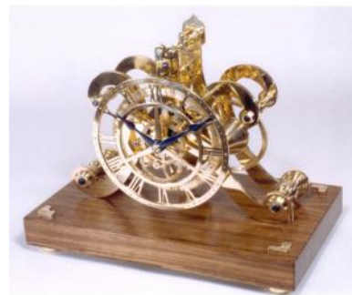
Epicyclic Train Strutt Skeleton Clock