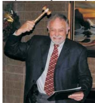
Running Out of Ideas!

Our chapter provides one of the most comprehensive programs for twelve month of the year. Not only do we have a main program, usually a live presentation, we often have a beginners' corner, and show and tell. Planning the program and providing information on upcoming events requires the efforts of board and chapter members. As your vice president for 2006-2007 and editor of the Tick Talk Times from 2008 to 2010 I have been planning and coordinating the monthly chapter programs. I will continue as newsletter editor but will not be planning future programs. This is nominally the responsibility of the